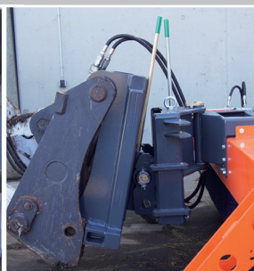
Roller floating tunnel with height indication and pendulum adapter