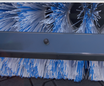
100 % PP-Beeline Mixed brush ring system