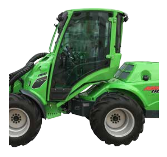
Height with cab 2230 mm