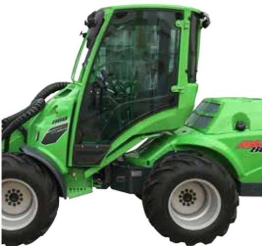
Height with cab 2230 mm